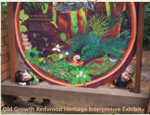
Old Growth Redwood Heritage Interpretive Exhibit